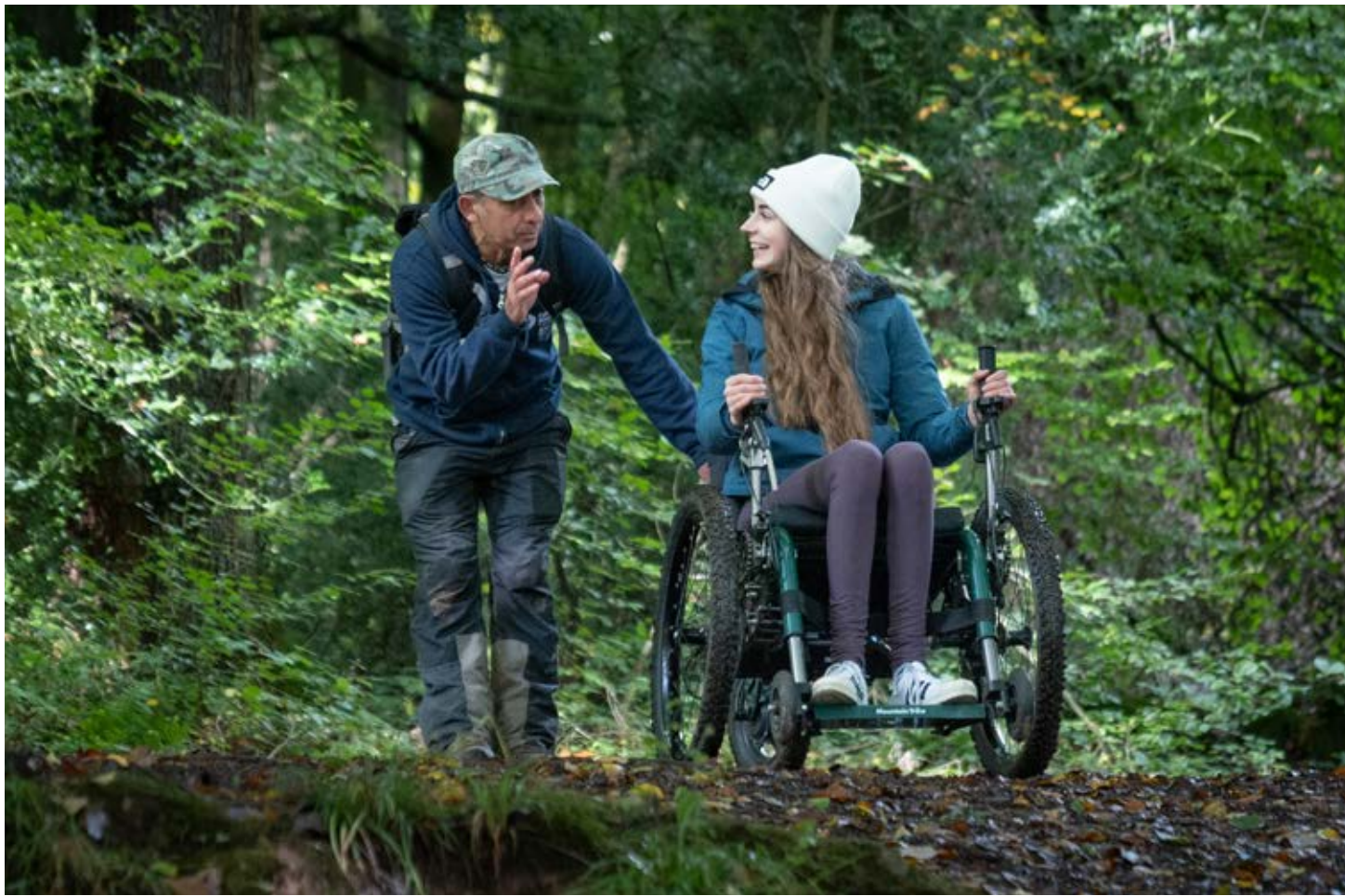
All-Terrain Wheelchairs at Whitestone. Wye Valley National Landscape.

As outlined, new approaches will be adopted to capture and join-up data across a wide range of destination touchpoints, from harnessing SMART technology within destinations to using AI to interpret and prioritise data findings. The Plan itself will remain agile and responsive to these insights.