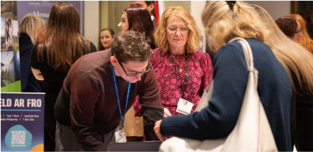
Visit Wales Industry Roadshow 2023.

Monmouthshire County Council will continue to play a leading role in marketing the destination, as well as harnessing our platforms to provide vital information to visitors and residents that are already in the area. This includes continuing to maintain a rich product database of everything the area has to offer on our website. Through this Plan we'll aim to secure funding and resources to deliver more high-profile marketing campaigns to attract longer stays.