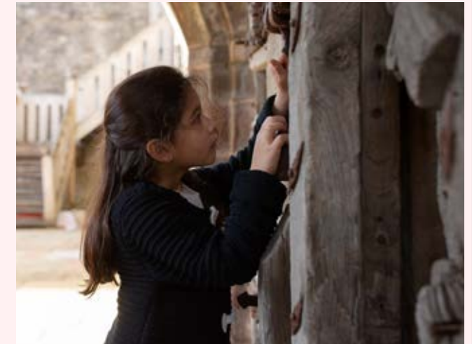
Chepstow Castle.

Monmouthshire County Council in partnership with cultural heritage bodies, such as Cadw.