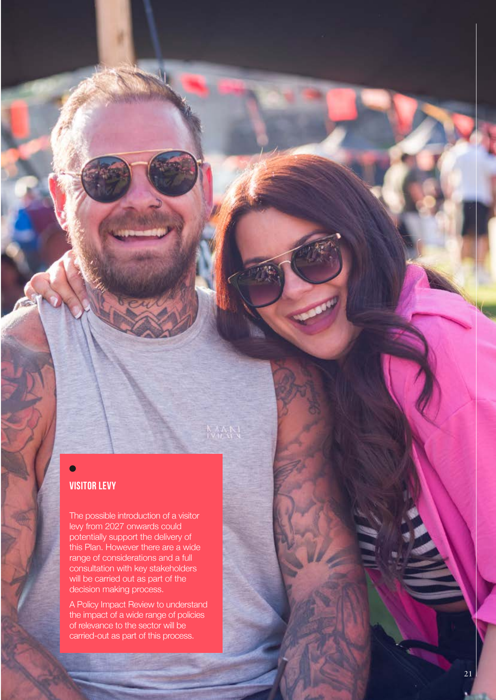
Opposite: The Big Banquet at Caldicot Castle.

This Plan is built on purposeful collaboration. To stand out and compete in an ever-changing marketplace, we need to work together like never before to deliver impactful experiences that inspire both visitors and locals.