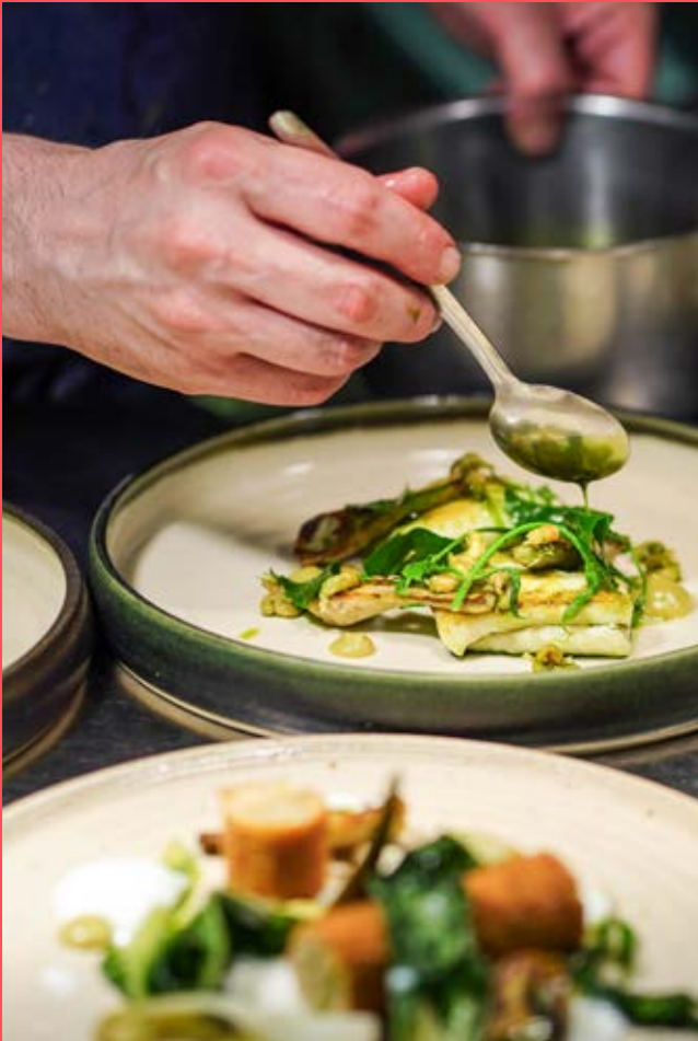
Abergavenny Food Festival. Kiran Ridley. Relaxing on the Sugar Loaf. Monmouthshire County Council. Michelin Star dining at The Whitebrook.