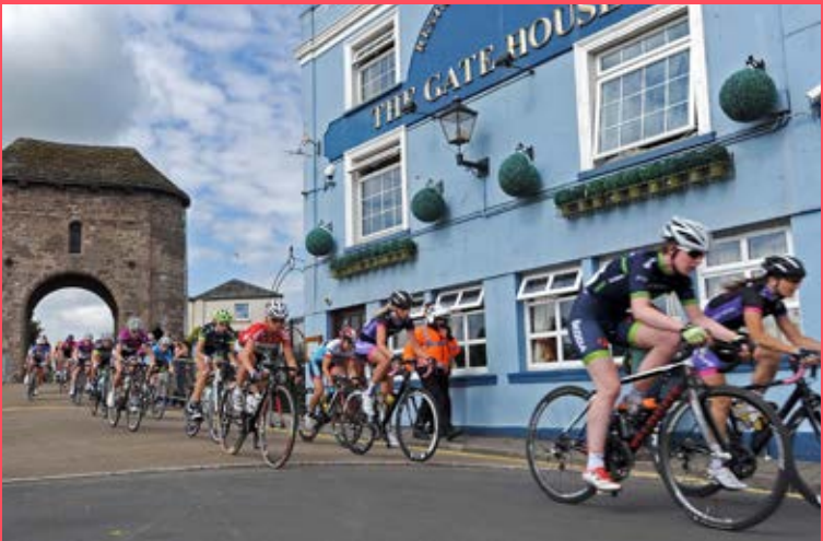
National Road Championship. Huw Evans. His Dark Materials at Dewstow Gardens. Bad Wolf / BBC / HBO. Campfire at Hidden Valley Yurts. Callum Baker. Cocktails at the Angel Hotel. Monmouthshire County Council.

Monmouthshire has inspired all kinds of creativity: Medieval poet Dafydd Llwyd praised the incredible fortress-palace at Raglan Castle, with its ‘hundred rooms filled with festive fare, its hundred chimneys for men of high degree’; at the turn of the eighteenth century, the Wye Valley famously inspired world-leading artists such as Wordsworth and Turner; and around the same time, Baroness Llanover creatively elevated the Welsh costume to national status. In the 1960s, Allen Ginsberg, one of the prominent poets of the beat generation, was influenced by the landscapes around him – and a little LSD – to pen an ode to Wales and the county for The New Yorker. More recently, the area has inspired Welsh poets, like Owen Sheers; global and UK music legends, from Queen to Oasis to Catatonia, who have produced tracks at Monmouthshire-based studios; and the television producers of Sex Education and Young Sherlock. It adds up to something special. Bringing these experiences to life to visitors tactically (through VisitBritain’s current ‘Starring Great Britain’ campaign, for example) and through creative experiences is a direct and immediate tourism opportunity. However, bridging strategically with the creative industries sector in the region to put in place a holistic growth plan across these important strands of the experience economy could bring transformative benefits.