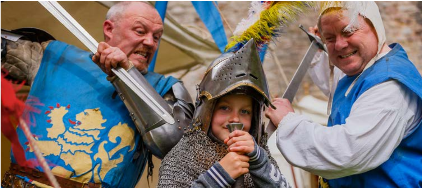
Knights at Chepstow Castle.

This Plan is all about delivering a high-quality visitor experience that is also good for residents. We'll continue to lead the way in Wales by making sure that our 'tourism' marketing isn't transactional, and that our brand, our content and our platforms cater for local people, and are co-created with them. We'll play a role in delivering content that cuts-through on the UK stage, generating civic pride here at home.