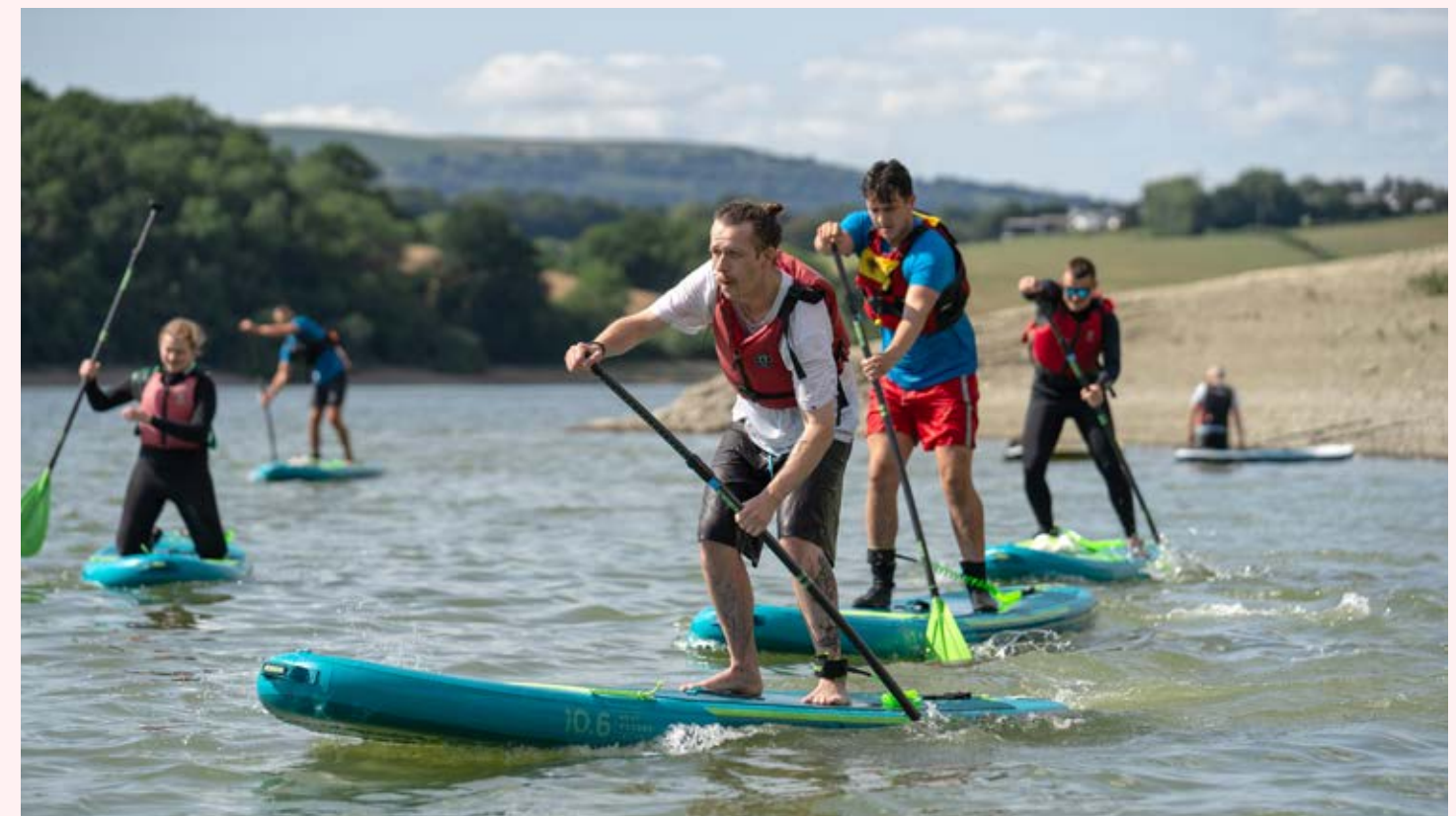
Stand-Up Paddleboarding at Llandegfedd Lake.

Monmouthshire County Council with environmental organisations and groups locally.