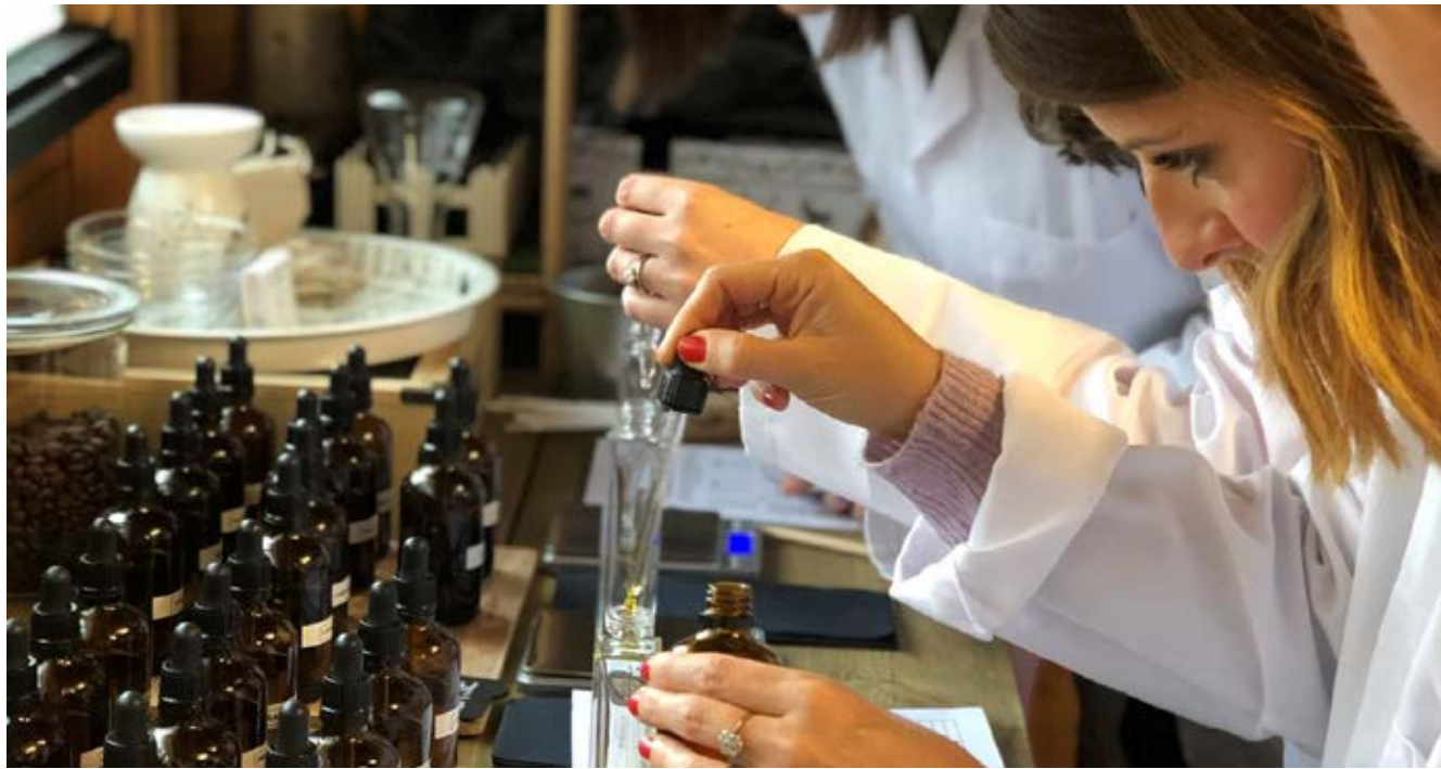
Wales Perfumery near Monmouth.

Monmouthshire County Council will proactively engage with localised tourism associations, identifying ways to support them – and any new or emerging organisations – to grow their reach and impact. The vision will be to gradually rebalance the model, so that the Destination Management Partnership becomes a strategic group, underpinned by a network of strong tourism associations overseeing the Plan's delivery at localised levels by 2030.