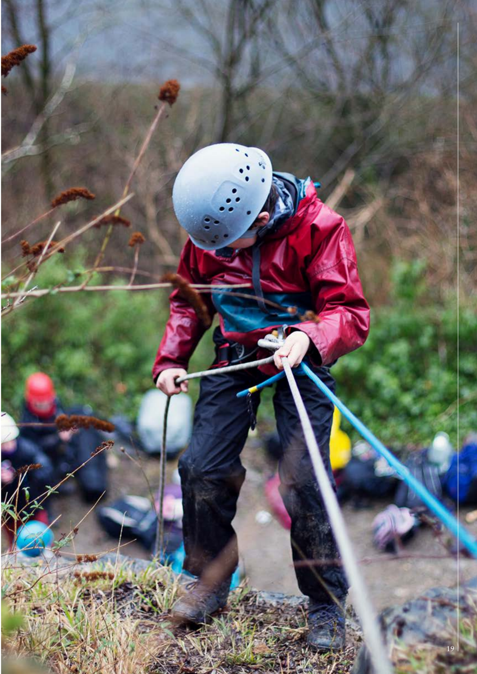
Opposite: Abseiling in the Wye Valley. Monmouthshire County Council.

This Plan provides a clear, confident framework to develop, and carefully manage, the visitor economy, ensuring it delivers lasting value to our people, places and way of life.