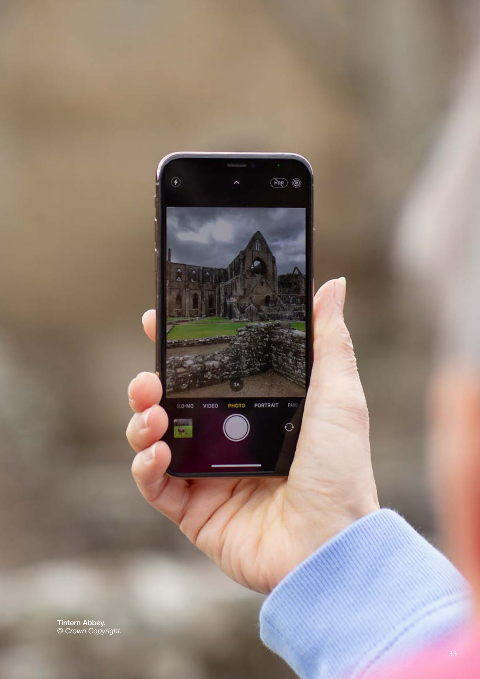
Tintern Abbey.