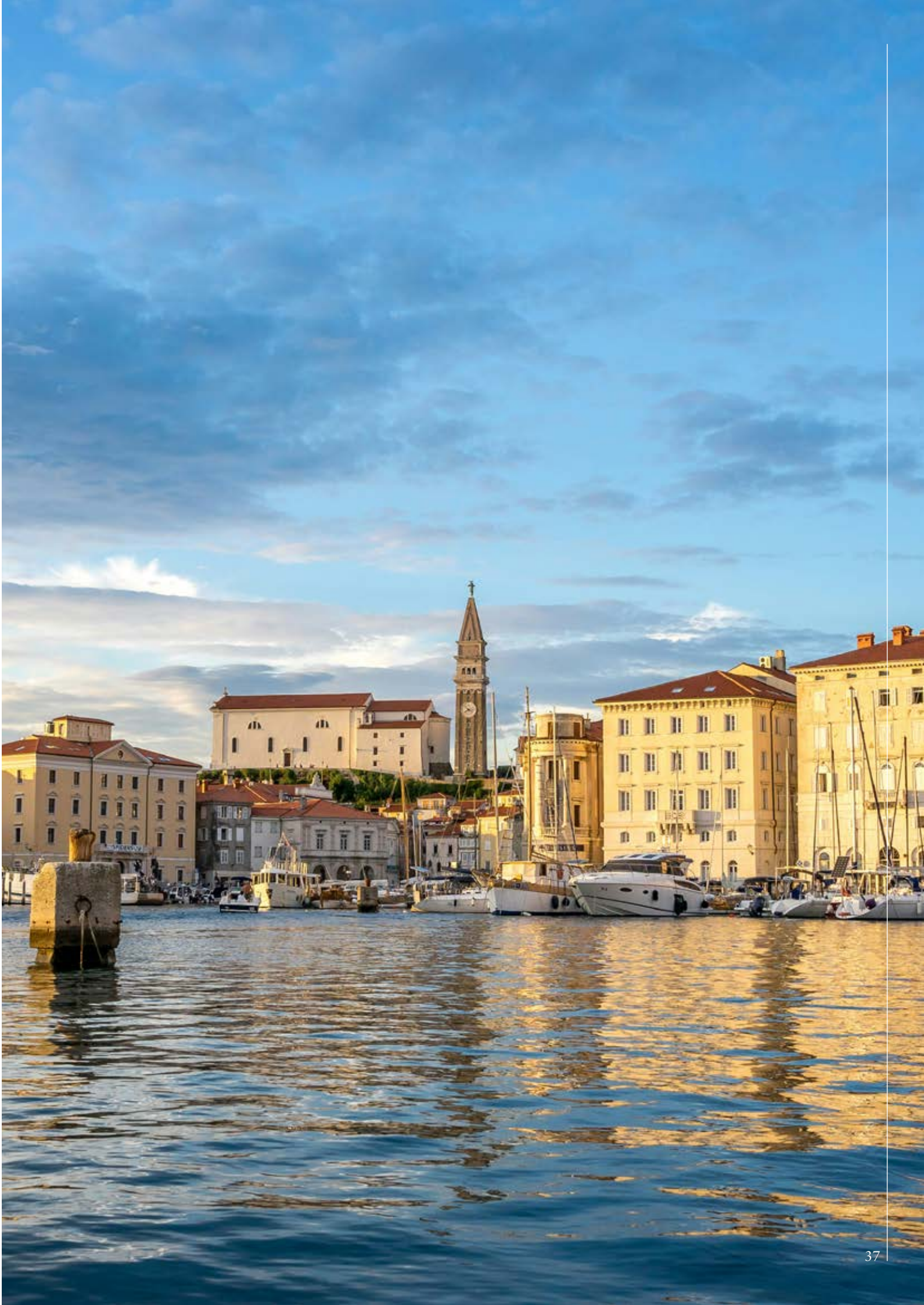
Opposite: Piran, Istria — one of the destinations that has inspired this Plan.

Crucially, they recognise that strategies and plans are just one part of the process: what they consistently have in common is a collaborative culture that embraces the challenges and potential of tourism.