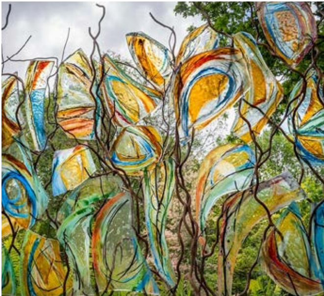
Wye Valley Sculpture Garden. Gemma Kate Wood. Foraging in Abergavenny. © Crown Copyright. Castell Roc Music Festival in Chepstow Castle. Castell Roc.

Finally, we'll continually explore the way in which other rural communities have harnessed creativity to shift their propositions, bringing examples of good practice to the Destination Management Partnership.