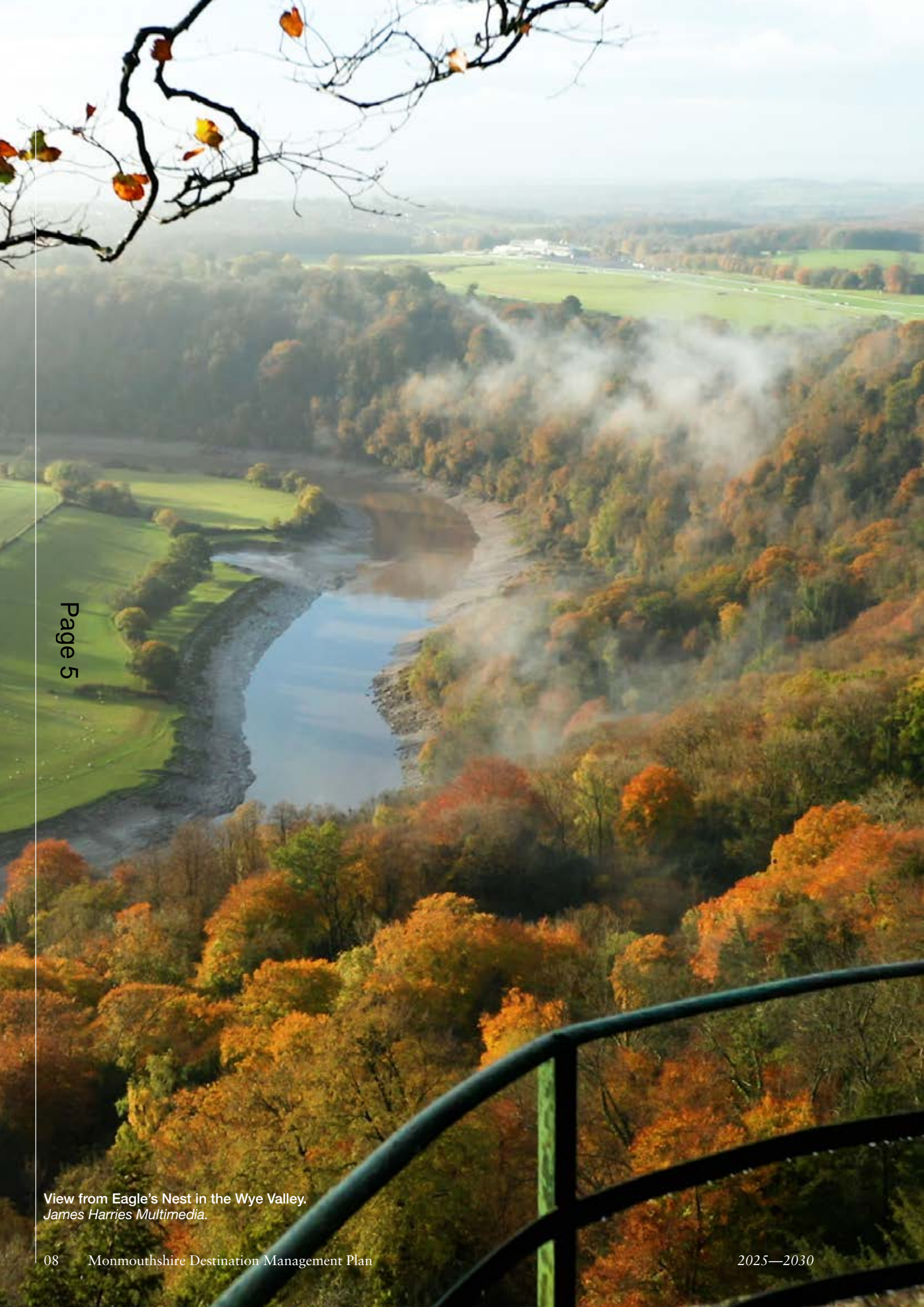
View from Eagle's Nest in the Wye Valley.