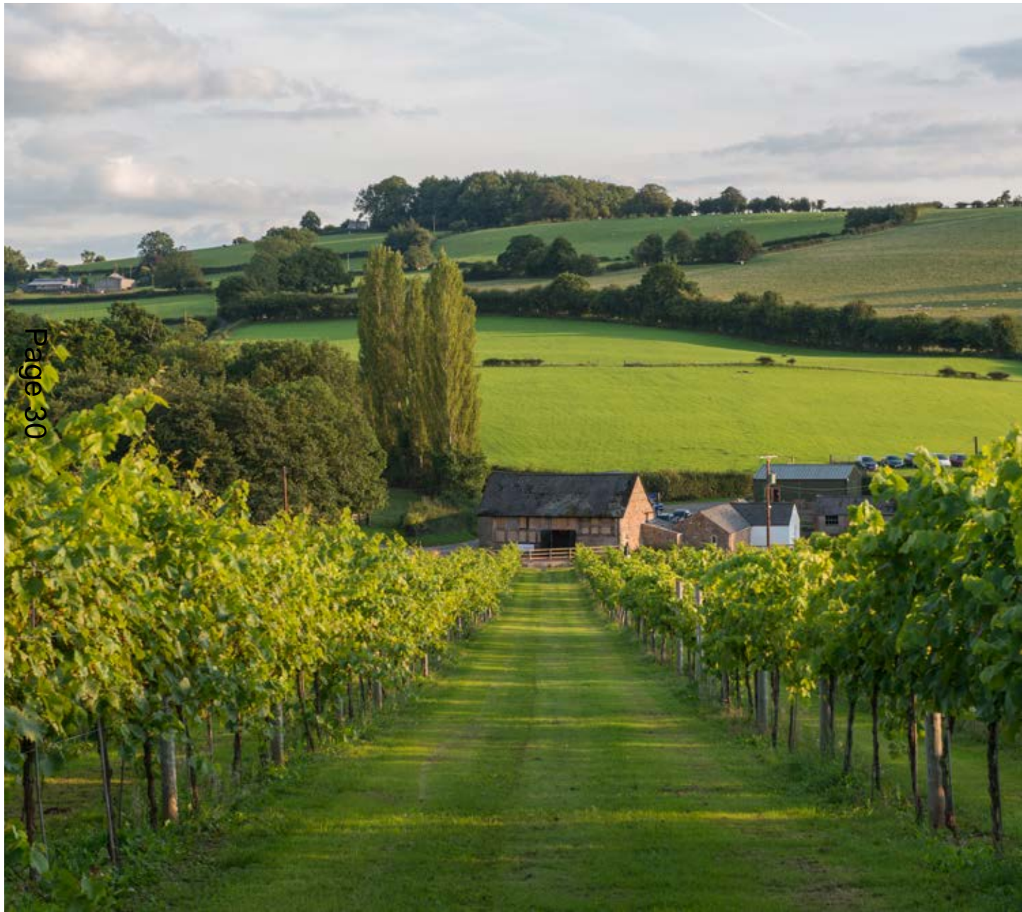
Tintern Abbey Cottage. Wonderful Escapes at Wern-y-Cwm Farm. Decanter World Wine Award winning White Castle Vineyard near Abergavenny.